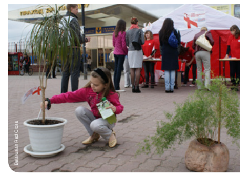
Belarusian Red Cross volunteers involved passers-by in Minsk in commemorating people who died from AIDS

In Belarus, more than 12 000 people are living with or affected by HIV, and each month about 80 persons are diagnosed HIV positive. More than 75% of HIV transmission cases are through sexual contacts.