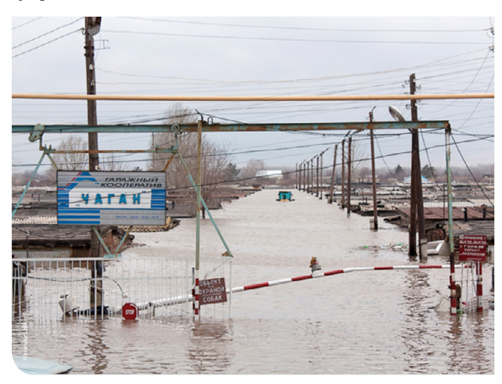
One of the areas of western Kazakhstan seriously affected by the floods

"On the basis of the needs assessment, the Red Crescent plans to assist 600 families - some 2,700 persons - with basic non-food items, including 2,700 blankets, 1,200 matresses, 2,700 bed linen sets, 600 towel family sets, 2,700 family hygiene kits, 600 kitchen sets, 1,000 hygienic packs for women and 120 diapers" explains Nurlan Panzabekov, Head of Disaster Management department of the Kazakh Red Crescent Society. "The National Society will also work to promote safe hygiene and sanitation practices, in order to prevent the spread of dis-