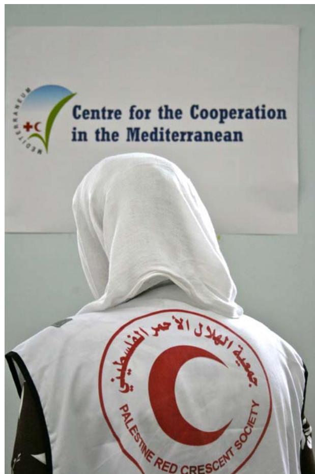
Seminar on Leadership for Youth Coordinators (Ramallah, Palestine)