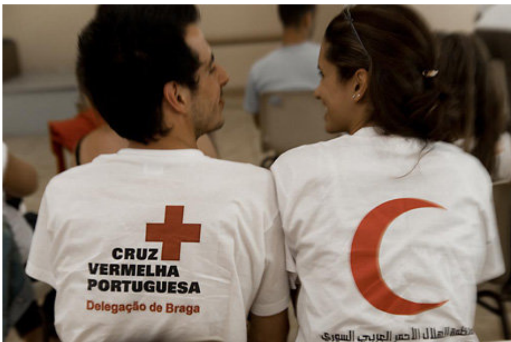
Youth Camp Atlantis VI (Marseille, France)