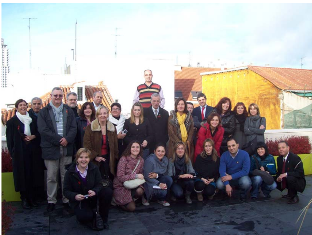
Exchange on Best Practices on Social Inclusion Programmes (Madrid-Valencia-Castellon, Spain)