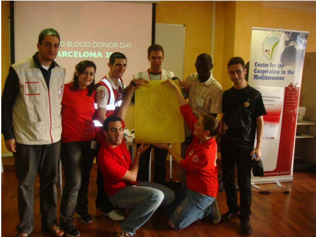
Youth Exchange on Blood Donation (Barcelona, Spain)