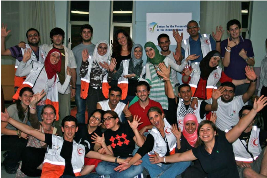
Seminar on Leadership for Youth Coordinators (Ramallah, Palestine)