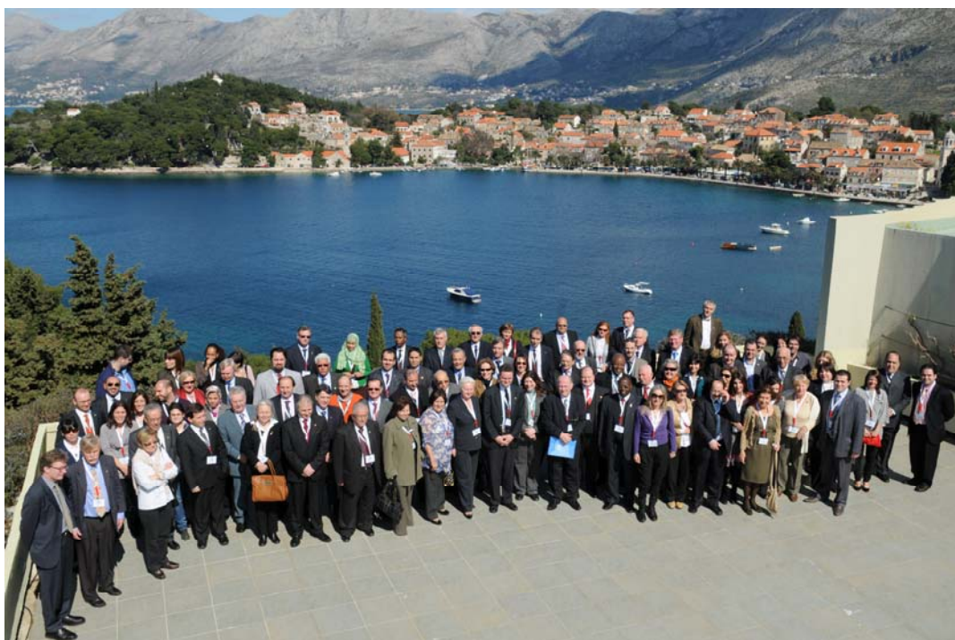
11 th Mediterranean Conference (Cavtat, Croatia)