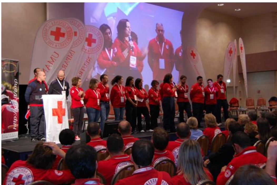
Italian Red Cross Youth, II National Assembly (Milan, Italy)