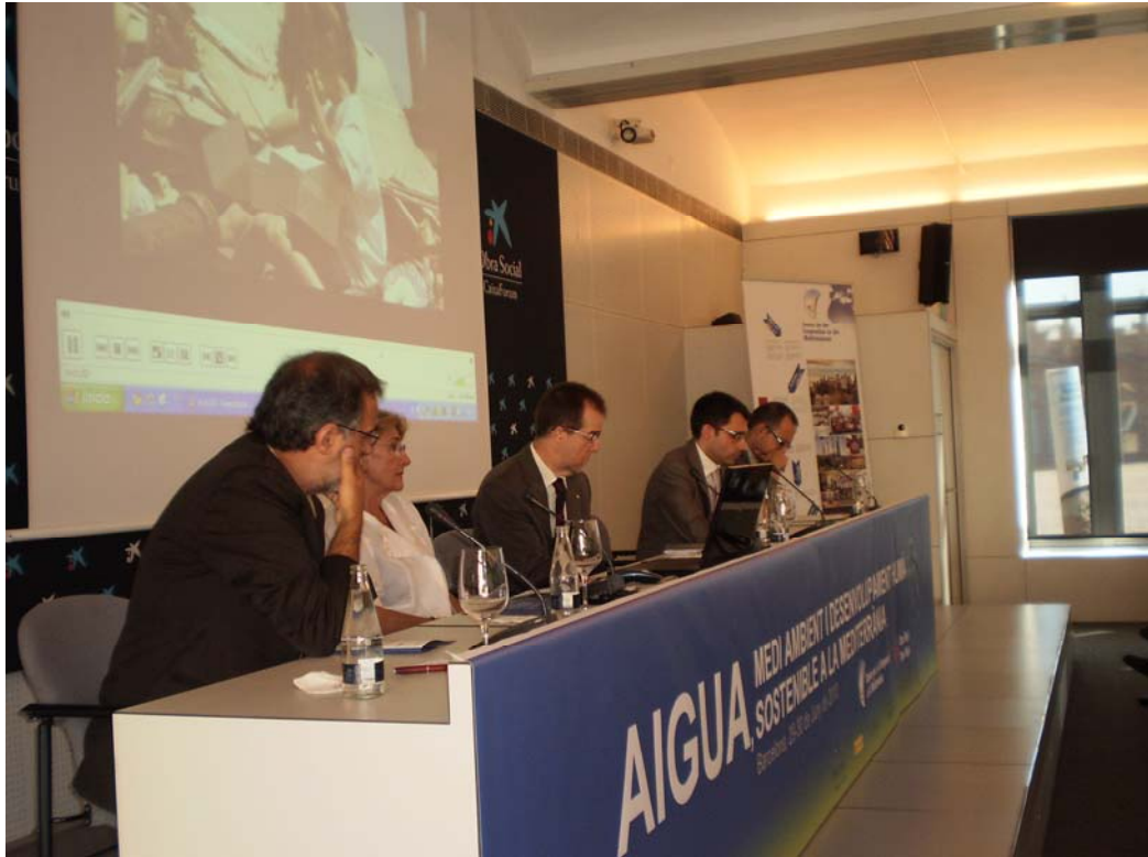
Seminar 'Water, Environment and Sustainable Human Development' (Barcelona, Spain)