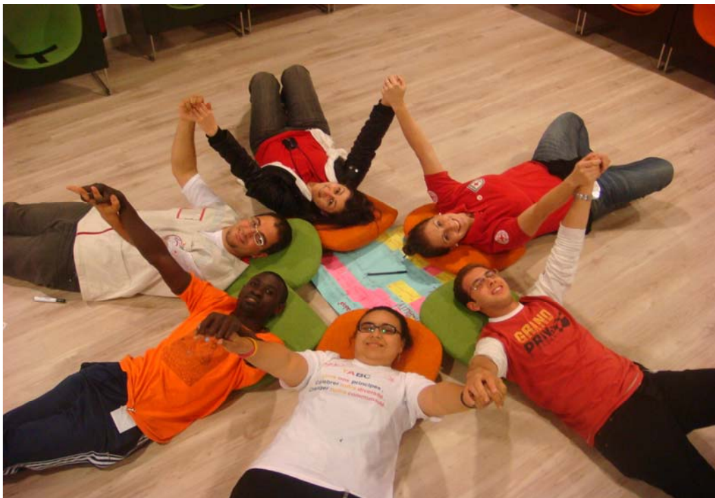
Youth Exchange on Blood Donation (Barcelona, Spain)