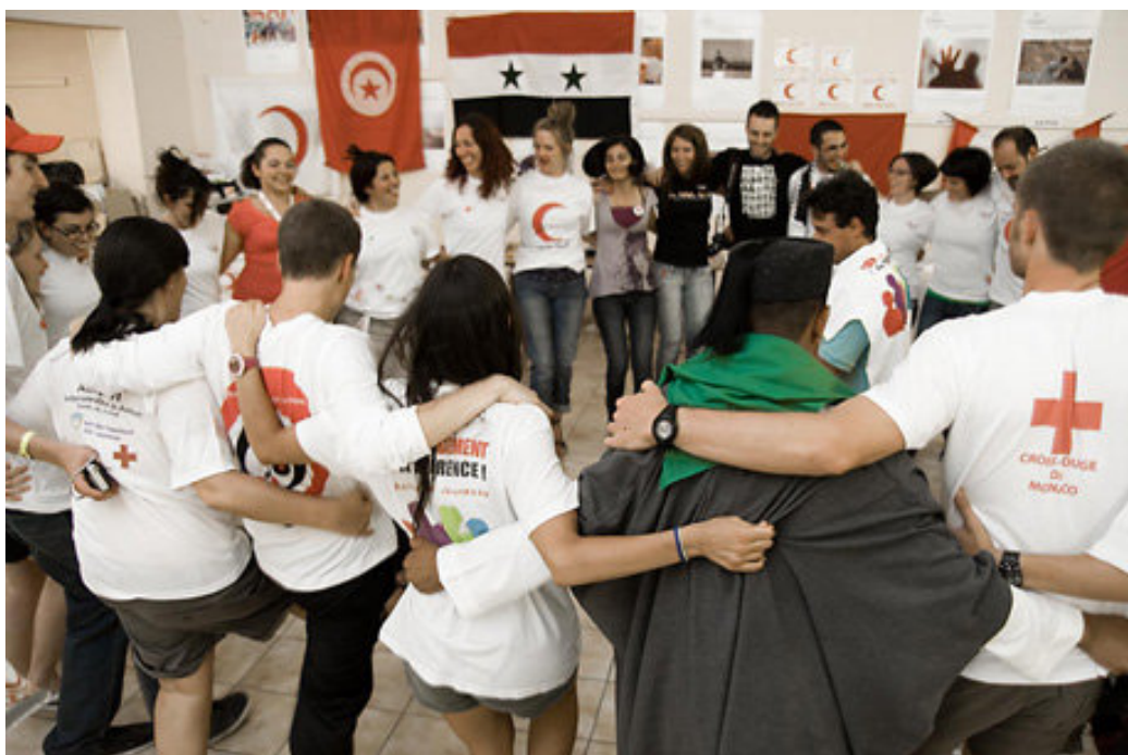
Youth Camp Atlantis VI (Marseille, France)