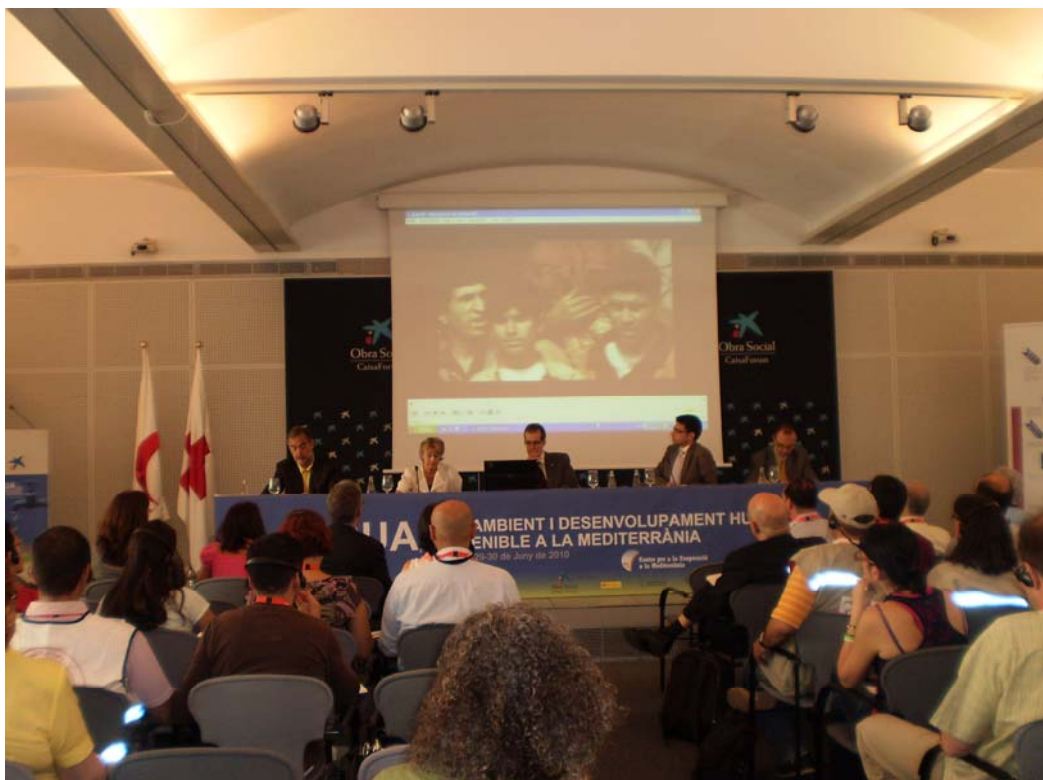
Seminar 'Water, Environment and Sustainable Human Development' (Barcelona, Spain)