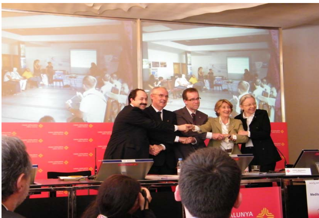
MoU signing: Mena Zone, Europe Zone, CCM (Barcelona, Spain)