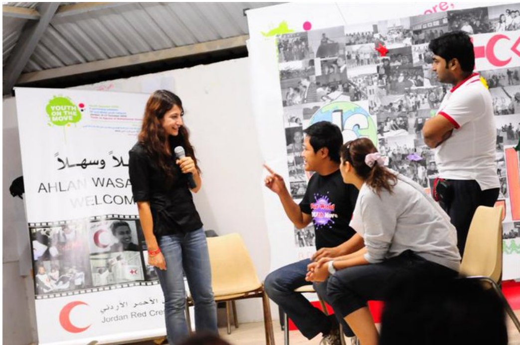
Youth Summit (Amman, Jordan)